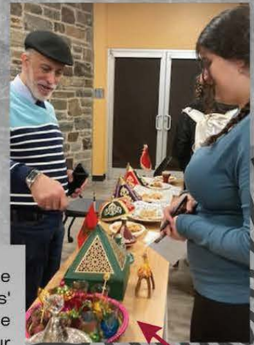
from one of the events in Francophone Week